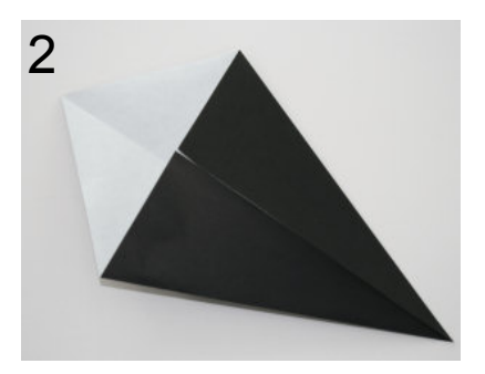
Bring two corners into the centre so that the edges meet the centre fold to form a kite shape, as shown.