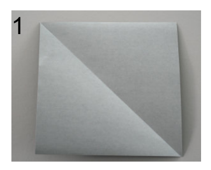
With coloured side down, fold your square in half along the diagonal, and crease.