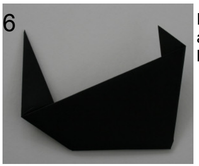
Flip over, and attach your head.