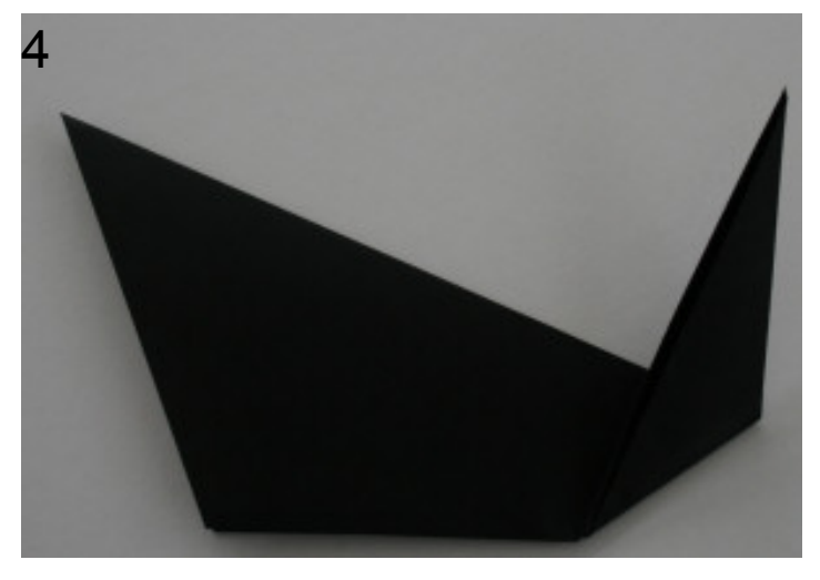
Fold the thinnest point upwards at an angle to form the tail, as shown. Vary the angle to create the effect you want.