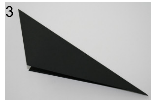
Fold in half along the crease.