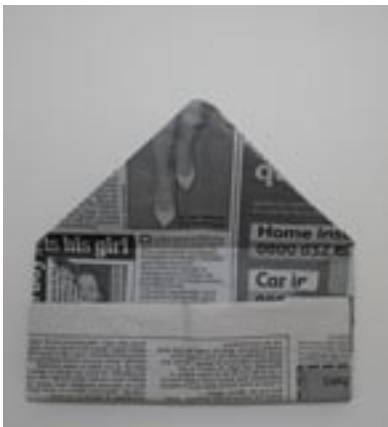
19. Open up again.