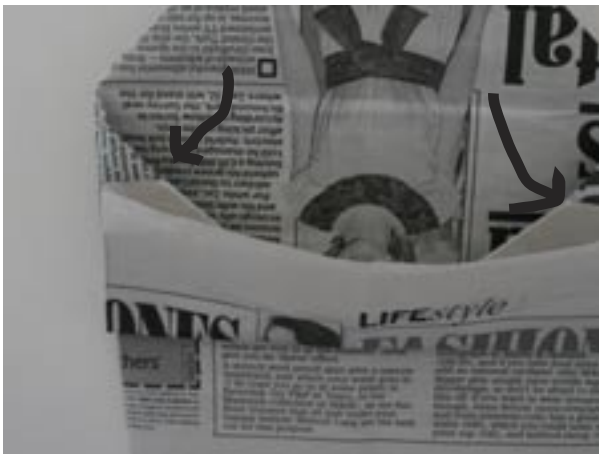
17. ...like this.