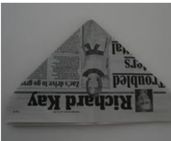
12. Fold the right flap over to the left.