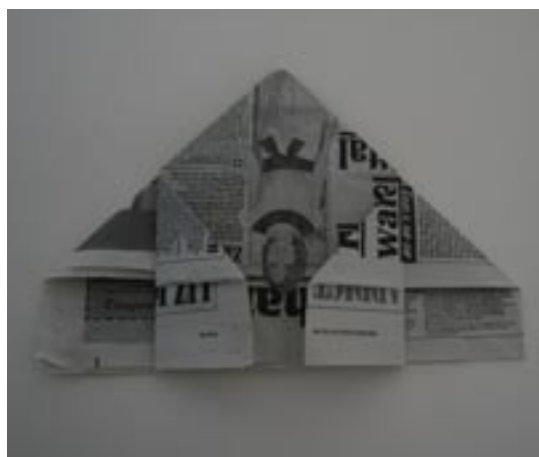
13. Bring both sides in towards the centre, as shown, creasing well.