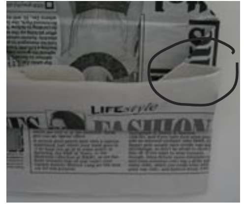
16. Inside the flap you have just folded, tuck a little triangle of paper around the diagonal fold of the paper underneath. Do the same on each edge and on each side (4 times in total) ...