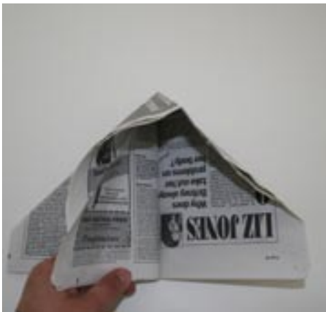
10. Once again, open the fold out and up, this time taking it towards the left side.