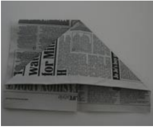
7. .... a shape like this.