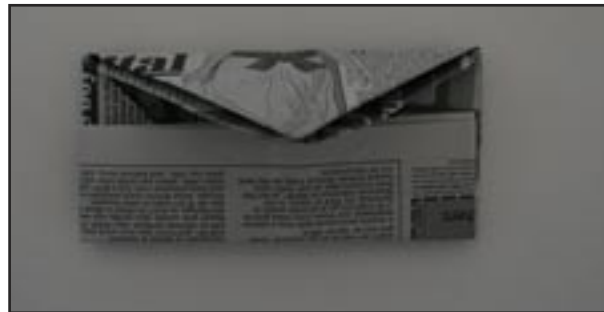
18. Fold the top point down as shown.