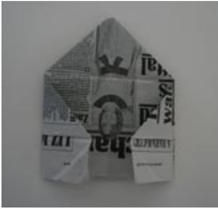
14. Flip over and do the same on the other side.