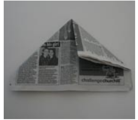
9. Now fold the right corner down, lining the edges up with the centre fold.