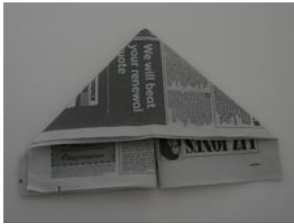
11. Your model should look like this.