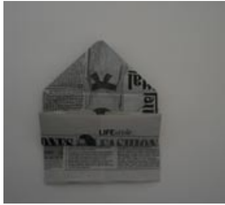
15. Fold the bottom edge up, as shown.