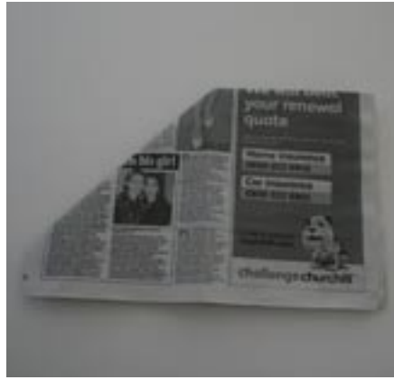
8. Flip over.